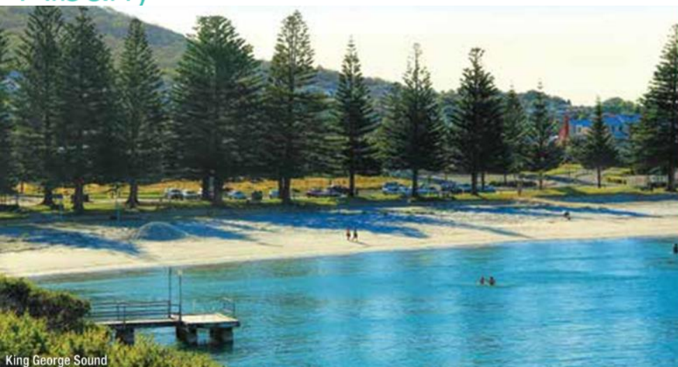
King George Sound